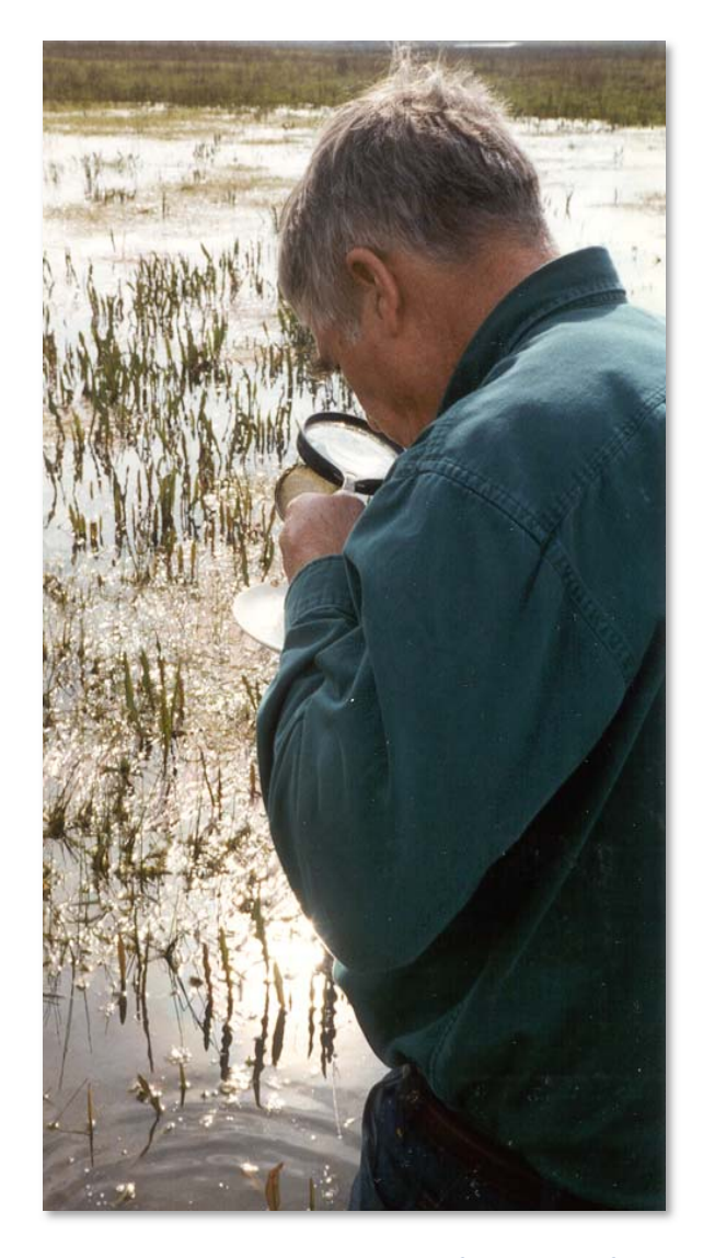
Our senior ecologists are certified to perform special status species surveys for a variety of wildlife, including fairy shrimp and other vernal pool invertebrates.

environmental and planning documents that appeal to both agency staff and the layperson. Because of our experience, our staff is proficient at guiding these documents through the often-frustrating local review processes.